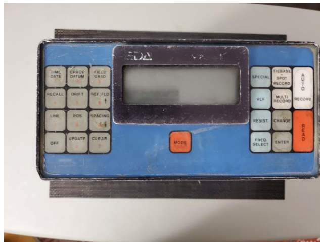
Figure 3. Our VLF receiver.

With the target oriented strictly orthogonally to the VLF profile, the induced magnetic field \mathbf{B} will be oriented along the profile, and there will be no transverse field. However, if the conductor deviates from the orthogonal direction by angle \theta , then you should see a non-zero horizontal transverse component of \mathbf{B} . The