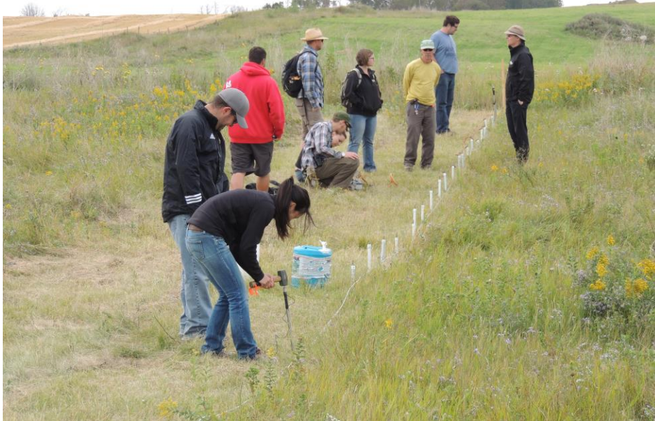
Figure 1. Small IP survey during Geophysics field school 2012. White ceramic tubes are the nonpolarizable electrodes

In Induced Polarization, a large current is injected into the ground by electrodes denoted A and B, and it electrically polarizes mineral grains that conduct electronically, like a metal or a semiconductor. The effect of this polarization is measured on two receiving electrodes called M and N. Polarization of this kind occurs at the fluid-solid contacts and is caused by the transition from ionic conduction in the pore fluid to electronic conduction in the mineral grain. Photo in Figure 1 shows how small IP surveys look like in our field schools.