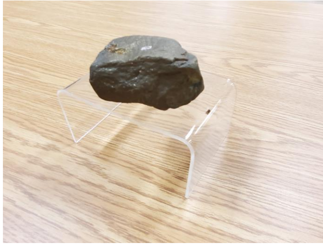
Figure 3. Mineralized rock used as target in IP tests.