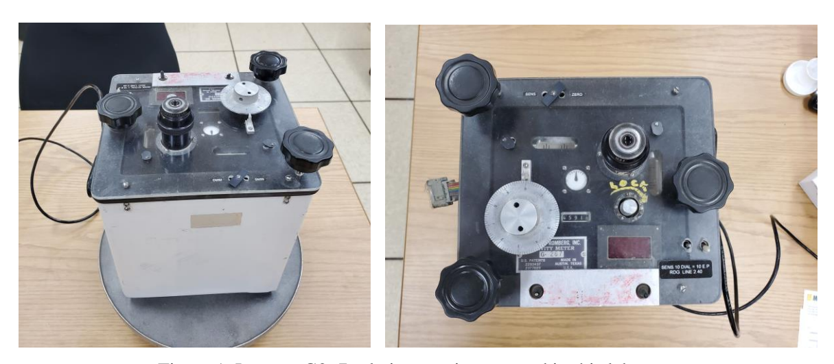
Figure 1. Lacoste G267 relative gravimeter used in this lab

In this lab, we will study gravity variation with elevation within the southwest stairwell of the Geology building. using a gravity survey performed Geology building. We will use two gravity meters, one of which is shown in Figure 1.