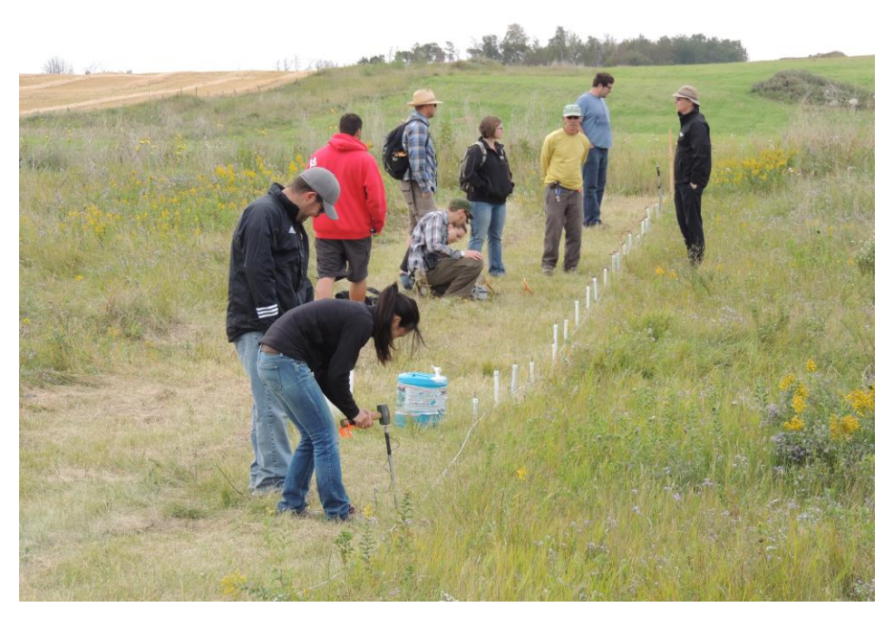
Figure 1. Small IP survey during Geophysics field school 2012. White ceramic tubes are the nonpolarizable electrodes

In Induced Polarization, a large current is injected into the ground by electrodes denoted A and B, and it electrically polarizes mineral grains that conduct electronically, like a metal or a semiconductor. The effect of this polarization is measured on two receiving electrodes called M and N. Polarization of this kind occurs at the fluid-solid contacts and is caused by the transition from ionic conduction in the pore fluid to electronic conduction in the mineral grain. Photo in Figure 1shows how small IP surveys look like in our field schools.