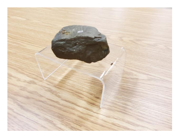
Figure 3. Mineralized rock used as target in IP tests.