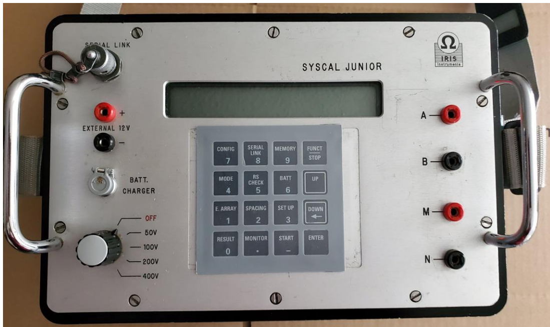
Figure 2. SYSCAL meter

(do not confuse water resistivity \rho_w with density above!).