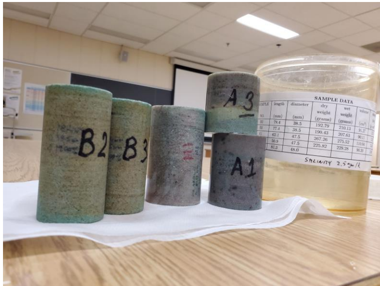
Figure 1. Core samples of this lab (Room 265 Geology)

Five rock core samples are supplied (Figure 1). The data on dimensions, densities and porosities are as shown in Table 1 in the attached worksheet file .