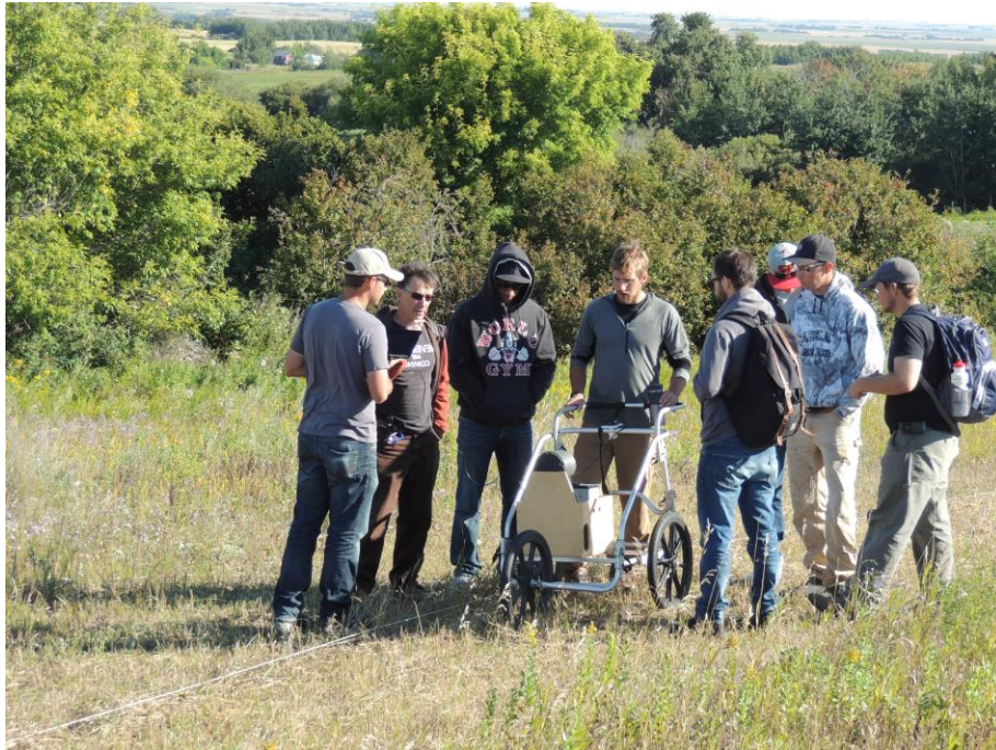
Figure 2. VLF data acquisition looked like this in our 2014 field school (the receiver and antenna are in the cart).